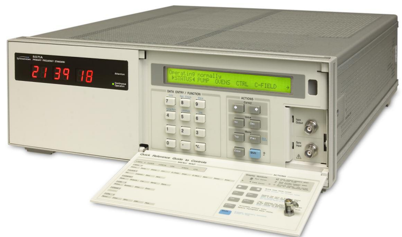
5071A Primary Frequency Standard

The 5071A offers exceptional stability and is the first cesium standard to specify its stability for averaging times longer than one day. The instrument takes into account environmental conditions that can heavily influence a cesium standard's long-term stability. Digital electronics continuously monitor and optimize the instrument's operating parameters.